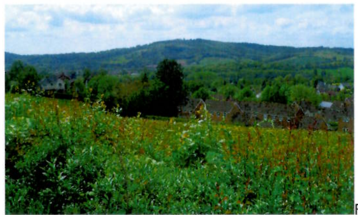
From Agincourt Road

In conclusion as to the question of Amenity Value, this is a standard term used in evaluating trees in the landscape. The noun amenity in this sense equates with pleasantness or attractiveness and whether the loss of a tree detracts from this. I have attached some photographs which show the tree to be visually prominent from a number of viewpoints.