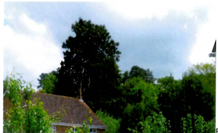
From Berryfield Park